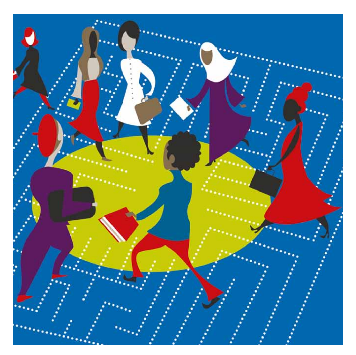
Support networking and mobilisation among women's organisations in conflict regions.