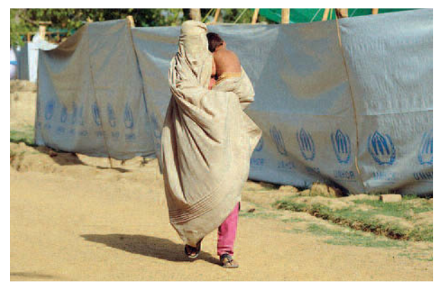
Jalala camp for IDP's fleeing the fighting in Swat. The camp consists of 900 tents spread over 50 hectares with room for about 1200 families (24,000 people). They were forced to flee their homes in the Swat valley following a breakout of violence between the Taliban and government forces. Almost two million people have fled the fighting, Jalala, Pakistan.