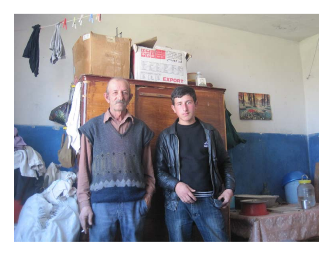
Father and son living in Zugdidi collective centre.