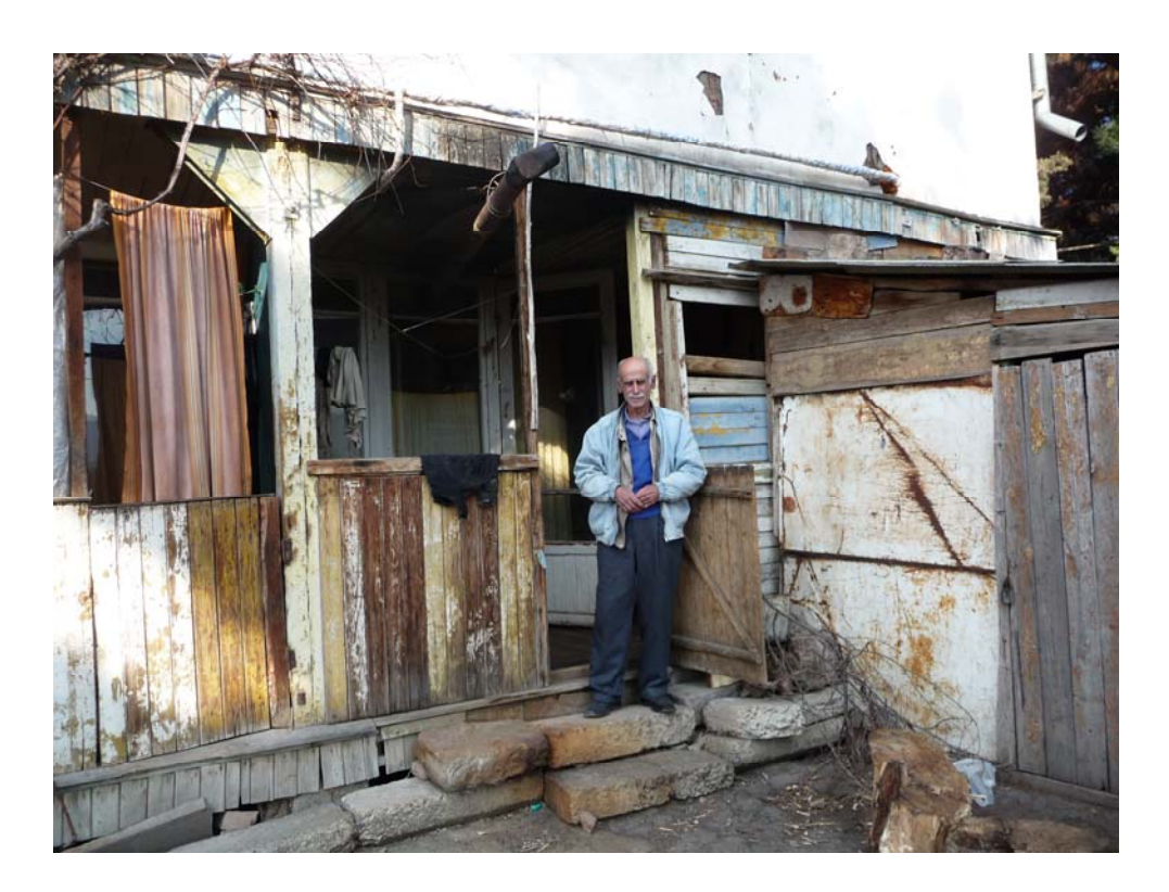
Elderly man in front of his accommodation at a collective centre near Gori (formerly a holiday camp).

The government's initiative to address the housing situation of displaced people in order to provide them with durable housing solutions is a positive initiative. However, this must be implemented in a manner which is consistent with the government's obligation to guarantee the right to adequate housing of all persons. The government needs to ensure that both old and new resettlement sites meet the criteria for adequacy of housing, under international law. It is particularly concerning that many displaced people have been living in buildings which were not designed to house people and that have lacked basic amenities for almost two decades. The government must also address the needs of displaced people living in or renting privately owned accommodation. It also has to ensure that the Action Plan is implemented in a non-discriminatory fashion and prioritises the most disadvantaged groups, while implementing housing solutions.