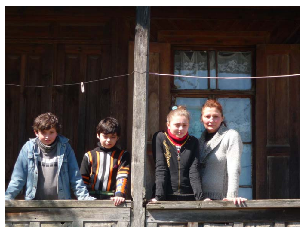
A family of IDPs living with relatives in Zugdidi.

This lack of information and awareness not only jeopardizes and delays the effectiveness of state programmes for displaced people but also deepens the isolation of IDP communities, and reinforces their dependence on the state. Without full knowledge of their rights, entitlements and options, displaced people will find it even harder to integrate into the rest of Georgian society.