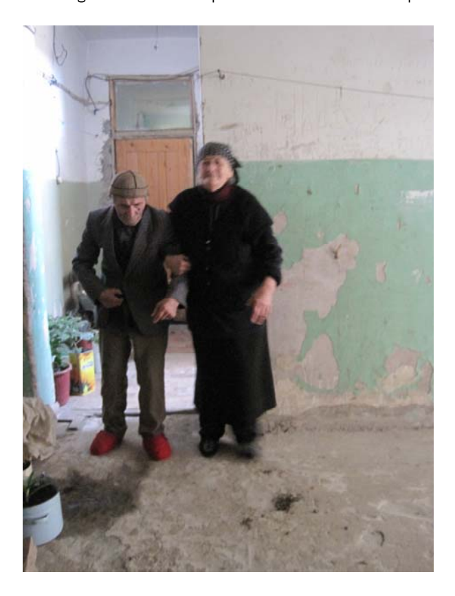
Elderly couple in a collective centre in Kutaisi.

Because of these barriers, displaced people are either left without care, or their families are pushed further into poverty. Financial constraints, lack of information and fear of unmanageable expenses also limit their willingness to seek healthcare until the critical moment. Even preventable diseases are rarely diagnosed quickly and treated adequately, resulting in serious consequences to the health of displaced people.