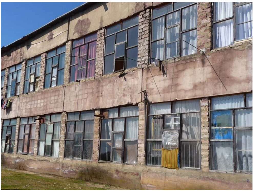
Collective centre in Zugdadi (a former printing works). People have been living here since they had to leave their homes in Abkhazia in the 1990's.