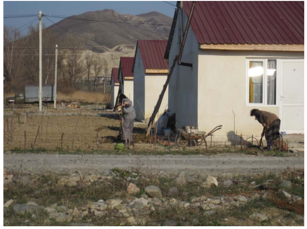
Women beginning to grow vegetables in the new settlement at Tserovani.

Amnesty International views these steps as important positive developments, however important concerns remain. Programmes to assist displaced people to earn a living are of a pilot nature and neither nationwide nor comprehensive. The action plan also fails to set clear indicators and benchmarks by which progress in relation to IDP employment can be measured and periodically reviewed. Efforts so far by both government and NGOs to provide vocational training for displaced people have been sporadic and unsustainable. The absence of follow-up on training and subsequent procuring of employment has resulted in many growing reluctant to participate in such training. <sup>103</sup> This is especially true for women, as it means time away from their households and children. As noted by the recent UNHCR study "the problem arises with the IDPs who have already participated in vocational training and refuse to participate in another, as such training is not usually linked with assistance to find a job and apply acquired skills, which are therefore rendered useless and not worth wasting time and effort." <sup>104</sup>