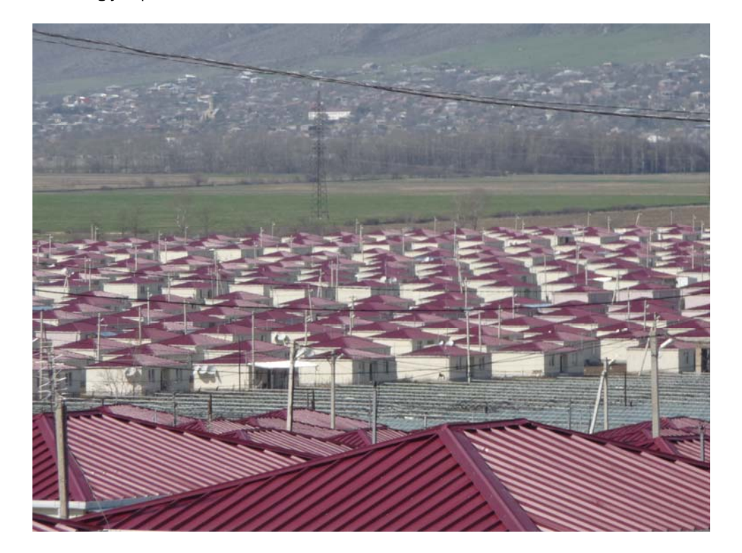
New settlement built by the government to house IDPs from the 2008 conflict near Tserovani.

During Amnesty International's visit to Tserovani and Tsilkani settlements in June 2009, residents complained that they had not been allocated any other agricultural land for cultivation, apart from the small parcel of land around their houses for kitchen gardens. Even in instances where they had been provided with agricultural land, it was of low quality for cultivation owing to a lack of available irrigation water and machinery. These factors have prevented many households from engaging in farming.<sup>77</sup> The biggest challenge cited by inhabitants, was the absence of employment opportunities, which made residents increasingly dependent on humanitarian aid or financial allowances.